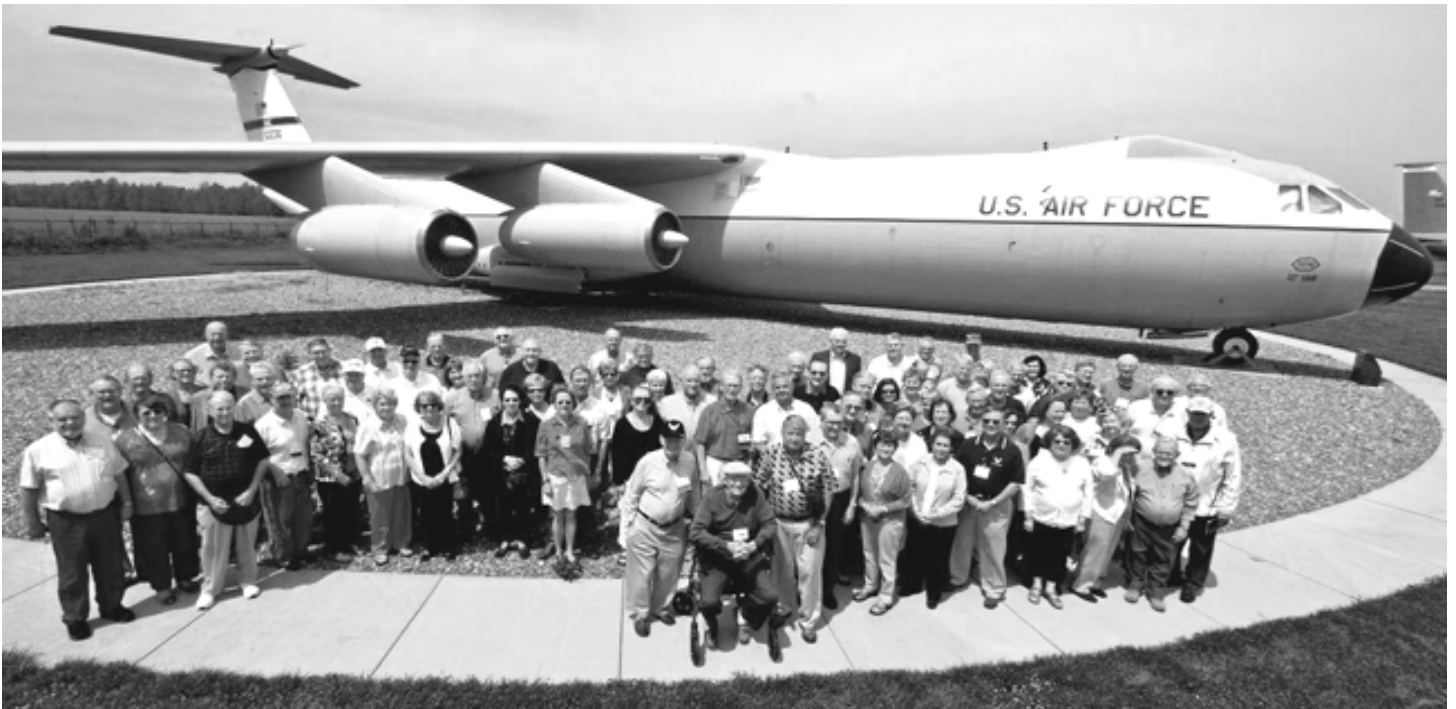
19th Annual Membership Meeting, May 3-5, 2012, St. Louis, Missouri & Scott AFB