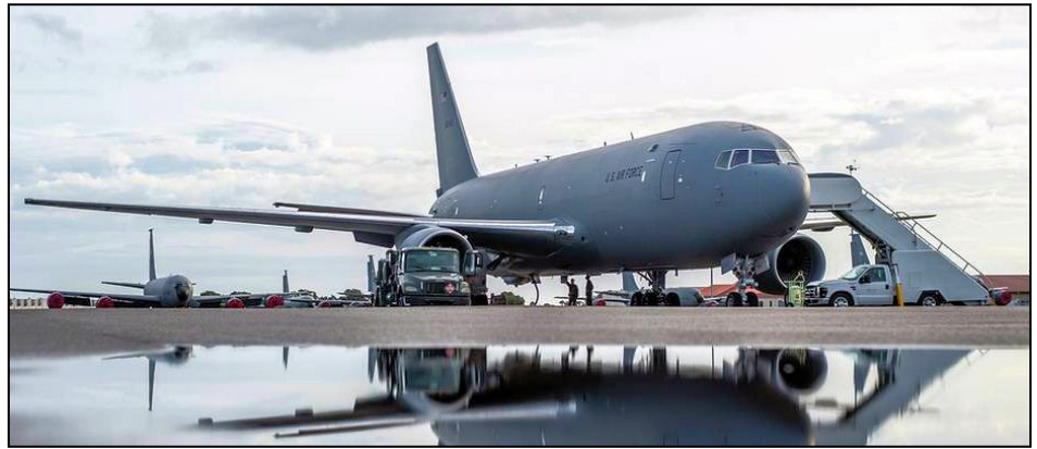
Above: A KC-46A Pegasus refuels on the flight line at MacDill Air Force Base, Fla. Oct. 25, 2021. The KC-46A is undergoing testing and expected to be permanently based at the Tampa-area base. Other bases where the KC-46s are expected to be stationed include McConnell AFB in Kansas; Altus AFB in Oklahoma; Seymour Johnson AFB in North Carolina; Travis AFB, California; Joint Base McGuire-Dix-Lakehurst in New Jersey, and Pease Air National Guard Base in New Hampshire. Below: A golf outing will be planned for the morning of Thursday, Oct. 26, 2023, at the Bay Palms Golf Complex.